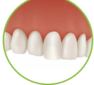
Once complete, a restored implant looks and functions like a real tooth.